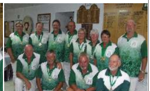
Die 2022 Goue Medalje wenners.