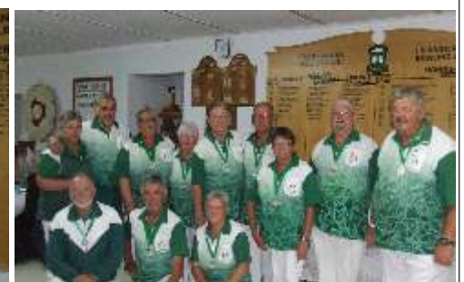
Die 2022 Silwer Medalje wenners.