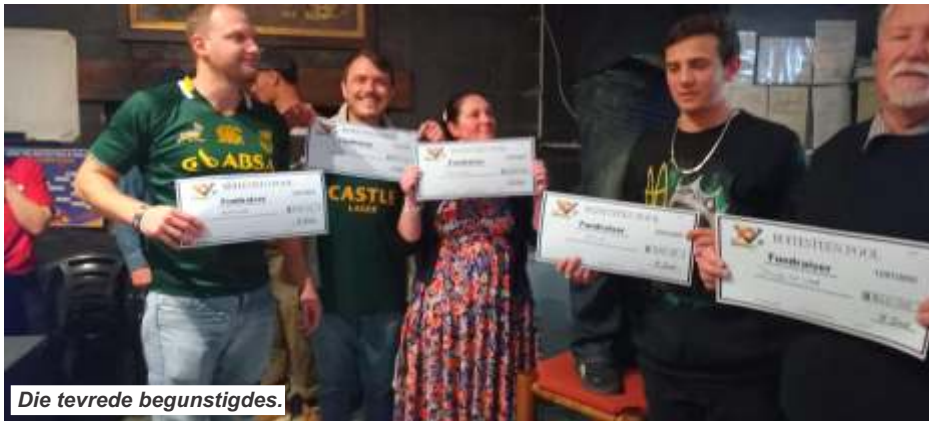
Die tevrede begunstigdes.