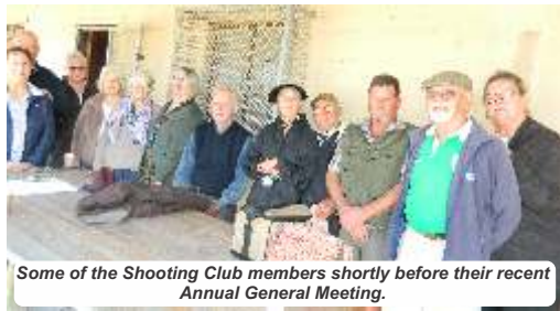
Some of the Shooting Club members shortly before their recent Annual General Meeting.

If there's one organisation in Gansbaai feeling truly disheartened right now, it's the Gansbaai Shooting Club. The Gans-Berg Nuus has reported on the club's misfortunes several times before - from repeated thefts and break-ins to deliberate vandalism of their clubhouse. Time and again, holes are smashed into the walls, burglar bars ripped out, equipment stolen, and the perimeter