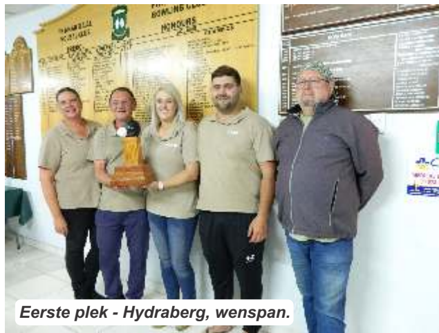
Eerste plek - Hydraberg, wenspan.

Dit was 'n paar bedrywige Dinsdae en Donderdae vanaf 18:00 saans, en daar is glo elke aand heerlik geëet en gekuier ná afloop van die wedstryde. Tydens die prysuitdelingsaand is die gebruiklike Spinwiel só goed ondersteun dat daar nie plek vir nóg 'n enkele