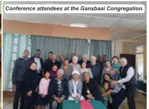
Conference attendees at the Gansbaai Congregation.