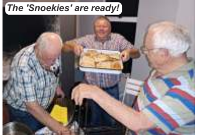
The 'Snoekies' are ready!