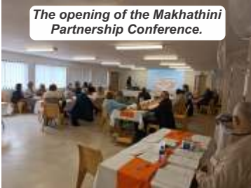
The opening of the Makhathini Partnership Conference.